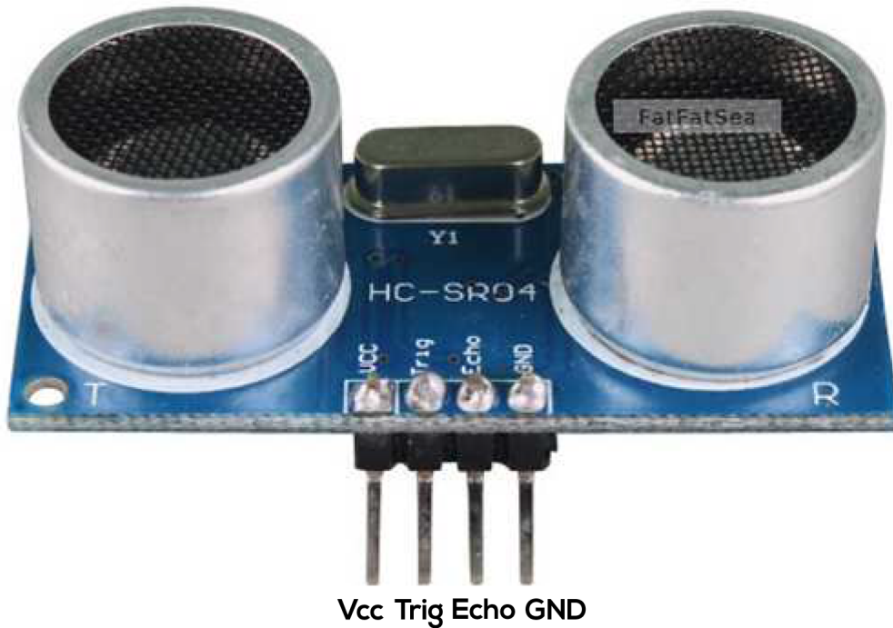
Vcc Trig Echo GND